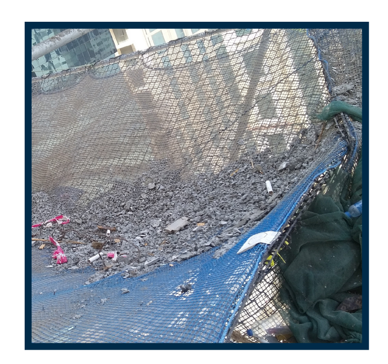
DROP SHEETS AND BUCKETS